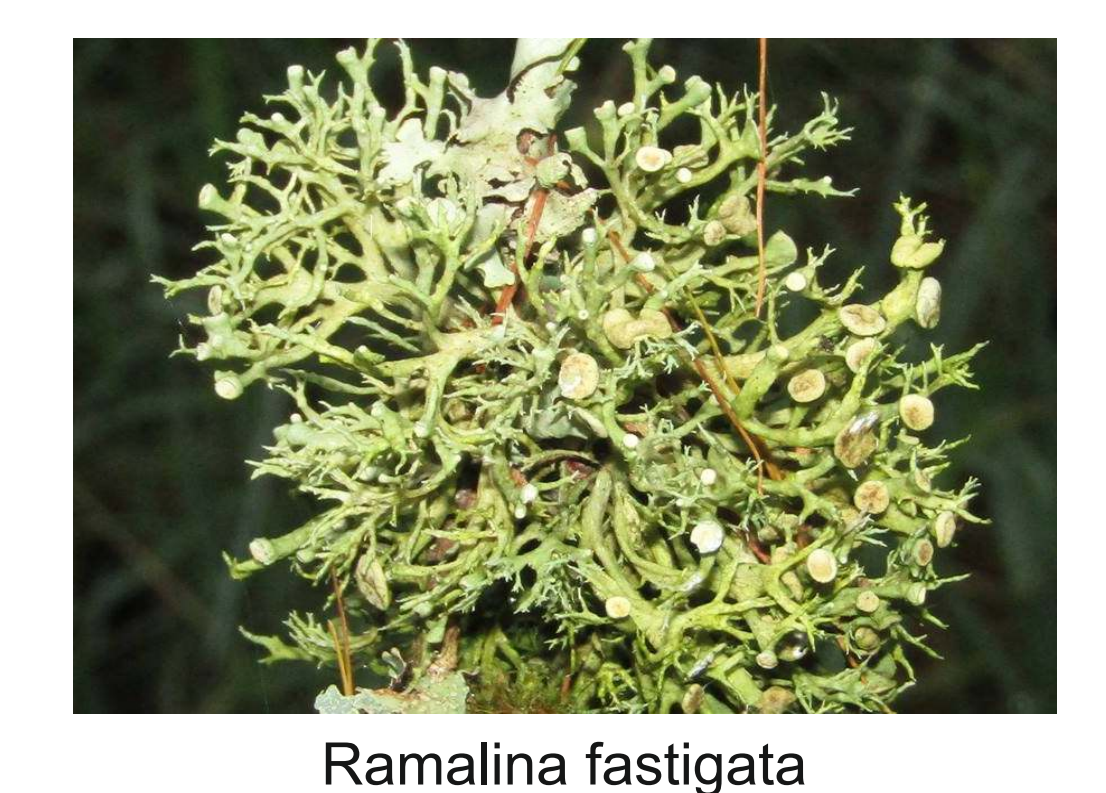
Grey/green branches irregularly shaped Branches ending in flattened fruits