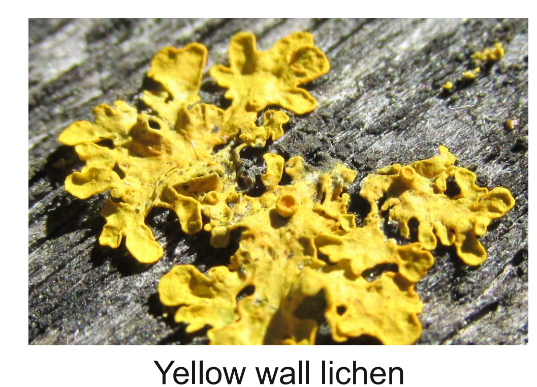
(Xanthoria parietina) Yellow or orange, often has 'cups' Very common, also found on rock, pollution resistant