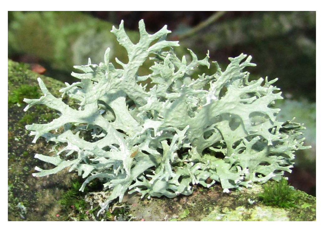
Oakmoss (Evernia prunastri) Grey/green branches - whitish underneath