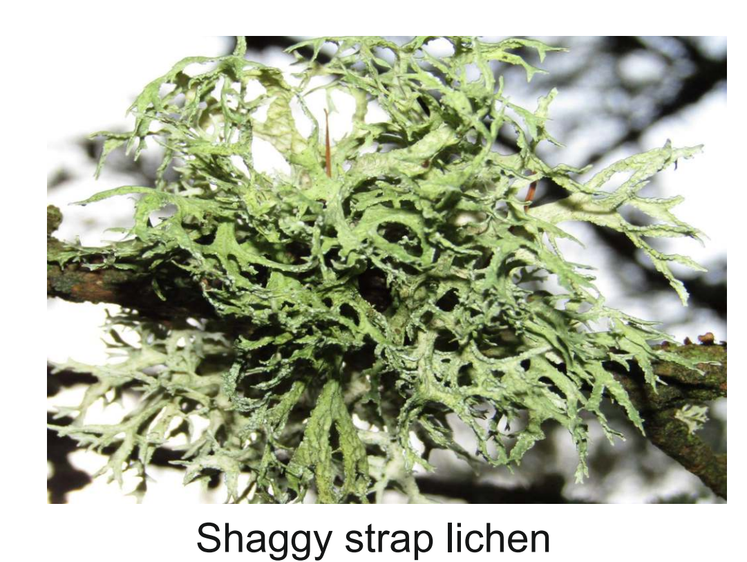
(Ramalina farinacea) Grey/green branches on top & underneath Branches narrow, 'knobbly' - branches irregularly

Often has black 'jam tarts' (bottom left of picture)