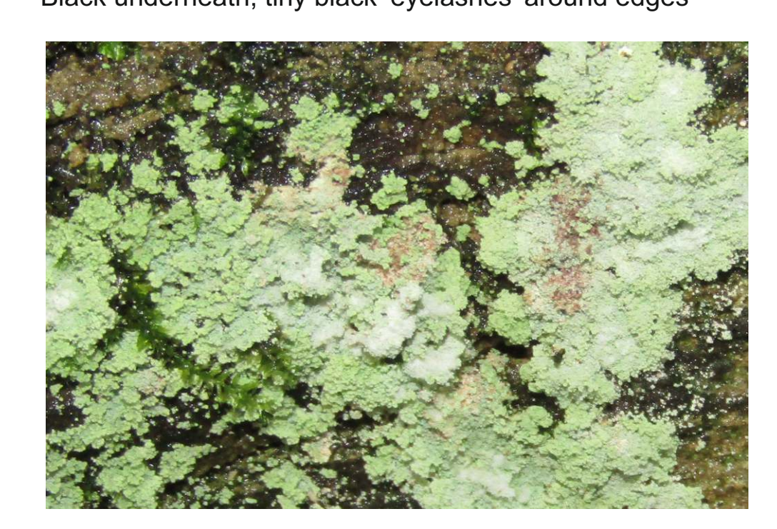
Dust lichen (Lepraria) Thin, powdery, pale grey or blue-grey