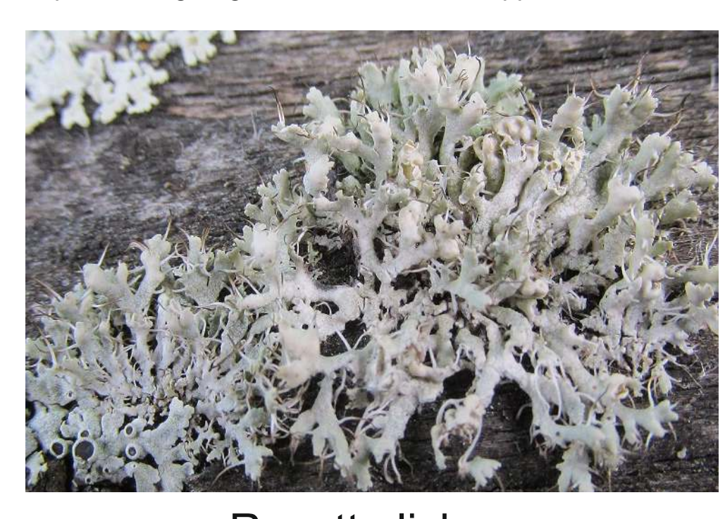
Rosette lichen (Physcia) Grey top & underneath, long 'whiskers'

Often has black 'jam tarts' (bottom left of picture)