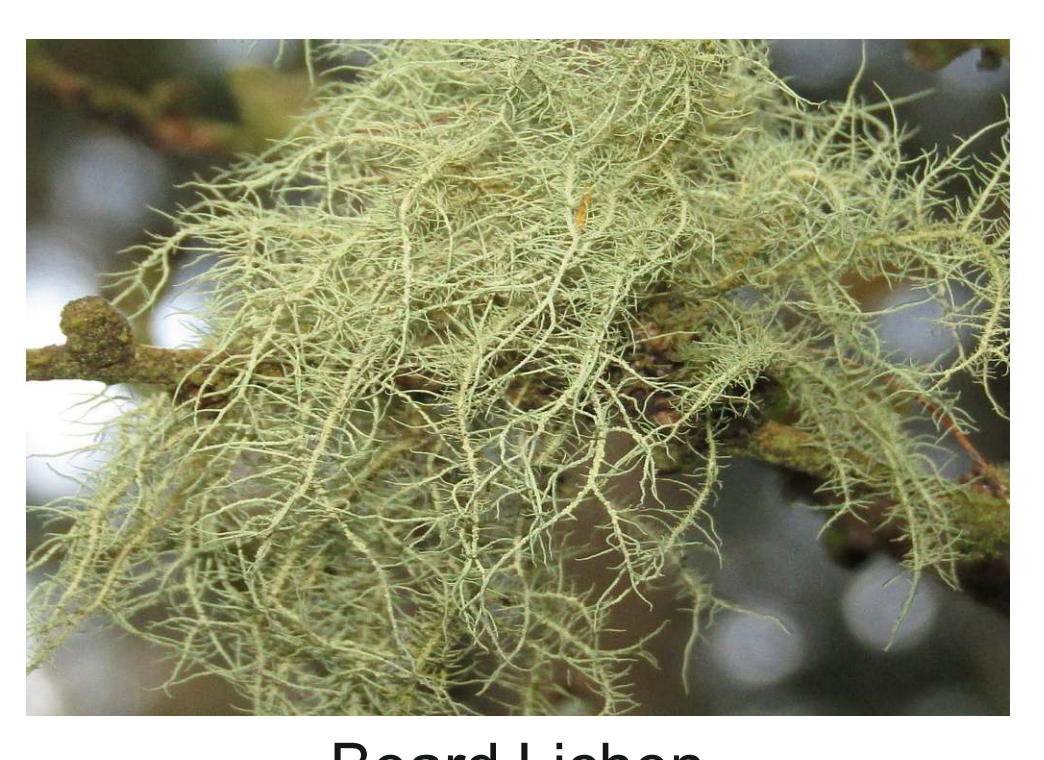
Beard Lichen (Usnea) Grey/green, much branched, fine branches