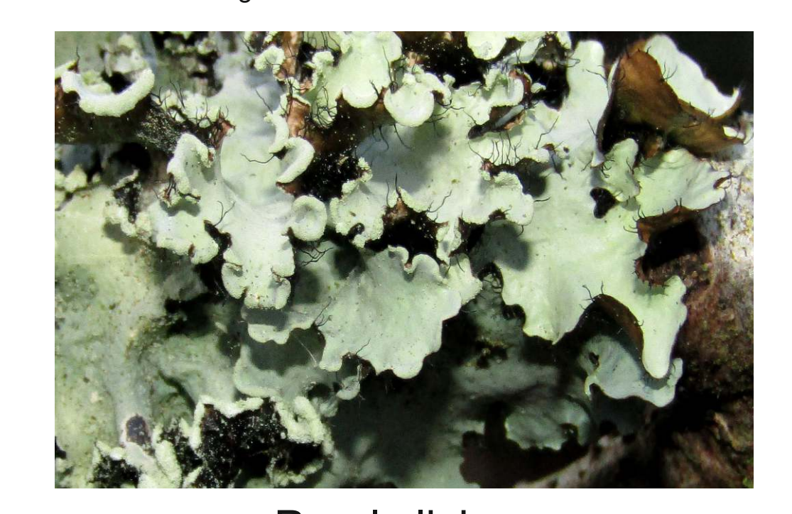
Pearly lichen (Parmotrema perlatum) Smooth & grey when dry, greener when wet Black underneath, tiny black 'eyelashes' around edges