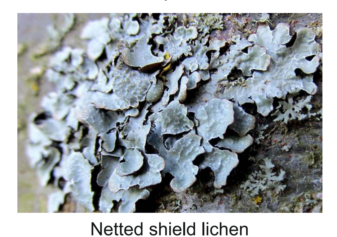
(Parmelia sulcata) Bluey grey top, dark underneath. Network of ridges & depressions giving a 'hammered metal' appearance.