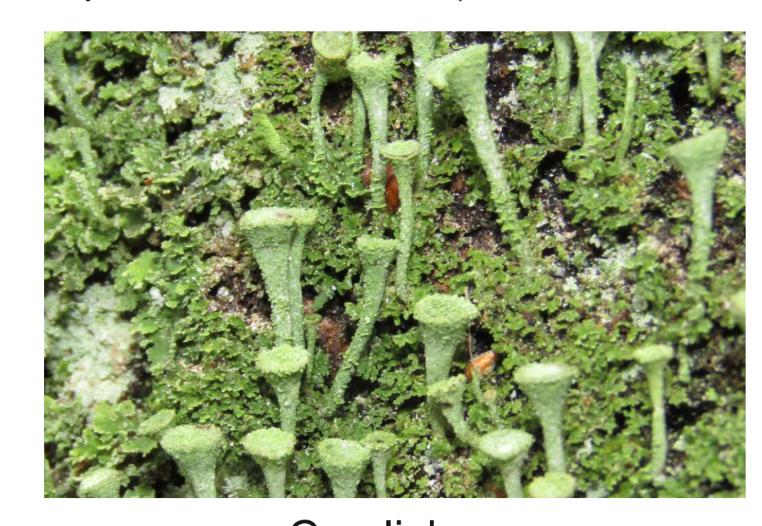
Cup lichen (Cladonia) Golf tee shaped cups, tiny green 'leaves'